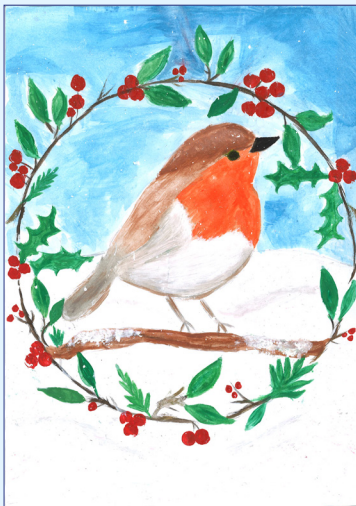
2nd Eden 7BB2

Congratulations to our six winners and well done to everyone for entering the competition.