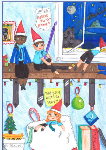
1st Willow 8BB1