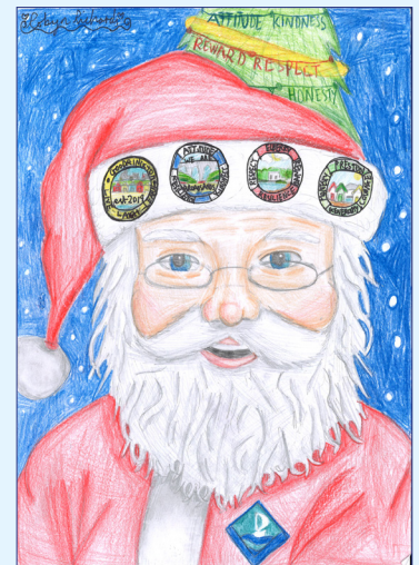
2nd Robyn 7WB1