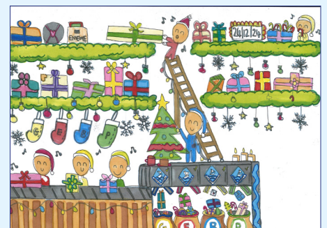
3rd Evie 8WP1